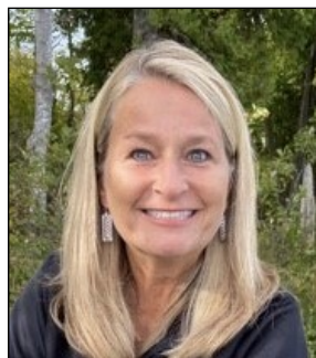
Lanette Paper Community Outreach