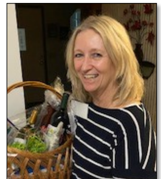
Rose Roe Galentine's Day